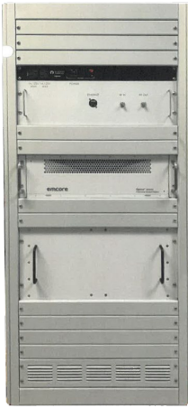
Actual Product May Vary from Demo Picture